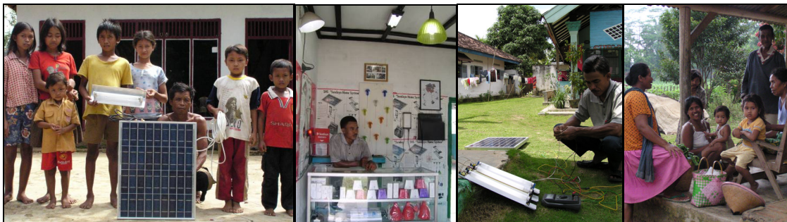
Fig.3: The SHS organic market in Lampung Province, Sumatra. From left: 1) A farmer who had owned SHS since 1991 purchased a second SHS package. 2&3) The SHS technician displaying spare parts in his outlet and demonstrating a simple SHS current-voltage (I-V) testing. 4) An SHS user discussing SHS with neighbours. (Photos: M Retnanestri 2005).

SHS has been part of the ongoing activities of the local people who have demonstrated a high degree of technical reinvention (BCR bypass, system configuration) and social innovation (job creation, SHS is used beyond lighting purposes for swallow bird farming, users wanted PV-powered radio for working at field, donation to community facilities, strategy for reducing fire risk hazard from kerosene wick lamps, etc) indicating SHS acculturation into local life.