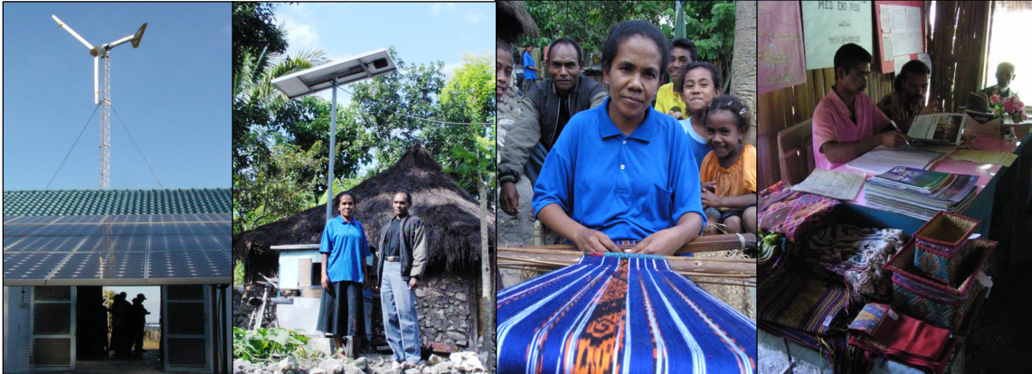
Fig.5: From left: 1) The PV-Wind-Diesel hybrid system (21.8kW-10kW-20kVA) installed in Oeledo village, Rote Island/NTT. 2&3) PLD Pusu: A SHS subscriber whose also a weaver of West Timorese traditional fabric now able to work for longer hours and earn more. 4) Monthly SHS payment session at PLD Pusu office, in which the traditional weaving products were displayed for sales. (Photos: M Retnanestri 2005).

The Pengelola Listrik Desa (PLD), or village electricity management formed from among the users, was initiated by the 1997-2000 E7 project as a CDM test-wise tool, facilitated by the locally based Womintra NGO (E7 in Retnanestri 2007). A PV-Wind-Diesel hybrid system was installed in Oeledo village, Rote Island. The PLD concept was later replicated in other parts of NTT, including Pusu village, in which 150 SHS units were installed during 2003-2005 (Retnanestri 2007).