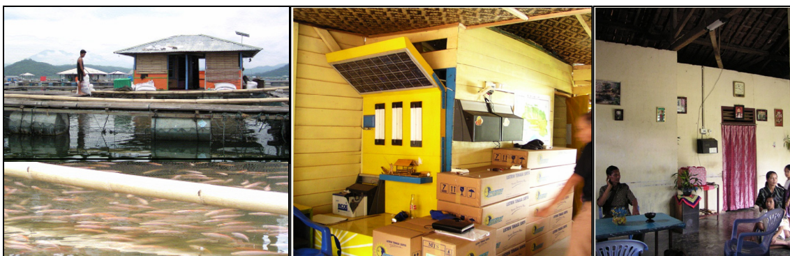
Fig.4: The WB/GEF SHS project. 1&2) Cirata Lake, West Java: A 50 Wp SHS installed on a hut roof of fish floating net powering lighting and telecommunication to support economic activities, and an outlet displaying SHS. 3) Lampung Province: The battery and the BCR are located in the living room allowing practical observation of charge state and acid level of the battery by family members. (Photos: M Retnanestri 2005).

In general users acknowledged SHS benefits (more practical, more reliable compared to the grid, improved quality of life, less use of kerosene and diesel fuel, creating jobs during project implementation) but there were also cases where SHS remained alien (lamps too bright to sleep at night, fear that brighter light provoked observation by thieves). The banking system remained unpopular (villagers preferred to keep their money under the pillow rather than depositing it in a bank, villagers preferred to spend their time working in the field rather than travelling to a bank office located a distance away from the village, the credit administration process involving a letter of recommendation from the head of the village was seen as disclosing a financial hardship to others) (YDD 2003 in Retnanestri 2007). Resolving this required an innovation in a non-technical dimension during project design and implementation for the local people to acculturate SHS in their lives.