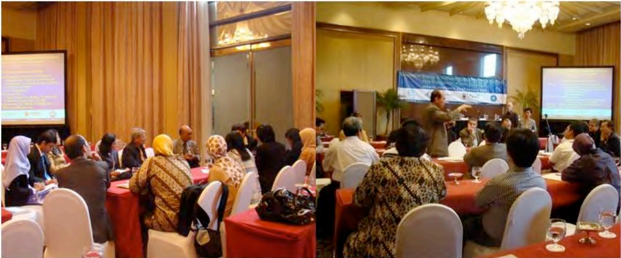
Figure 8. Group discussion activities.