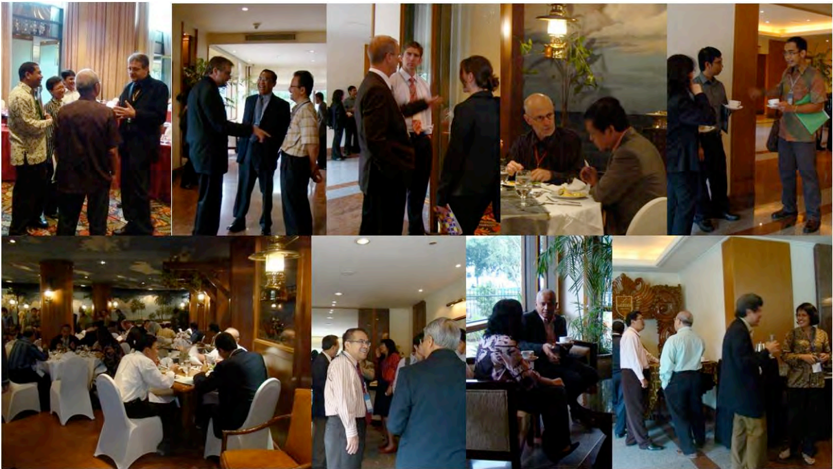
Figure 9. Networking activities among participants.