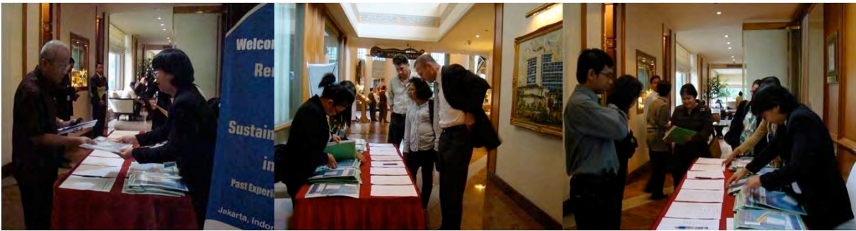
Figure 1. Workshop registration