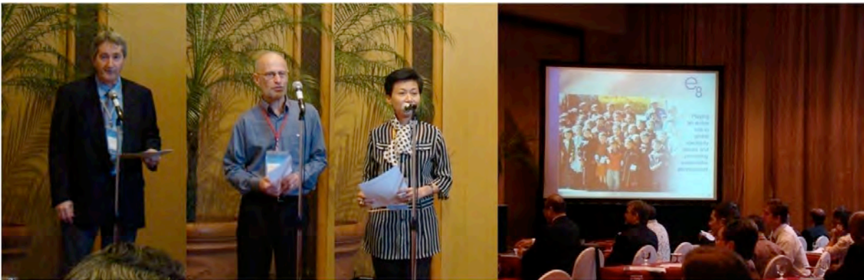
Figure 2. Workshop opening by the e8, UNSW-ADRA/AusAID and STTNAS representatives